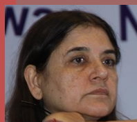
Smt. Maneka Sanjay Gandhi, Hon'ble Minister, Women & Child Development

“CARA and adoption are number one on my priority list. I have zero tolerance for delays in the process of adoption and we are continuously working towards bringing down the time taken in the adoption process to four months. Soon, we will have fostering coming in. We also have revamped CARINGS to make it more interactive. District Child Protection Units (DCPUs) are going to play a crucial role in the new system as the supporting agency to all the adoption agencies.”